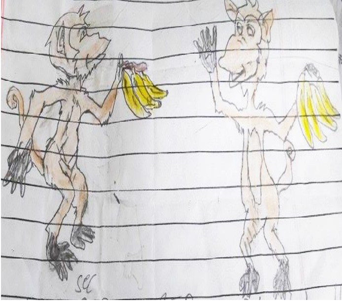
Art by : Basanta Kandel Class 3 "B"