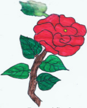
Pragati Sapkota Class 3 'B'