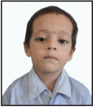
Seajal Bhandari Nursery 99.5%

Congratulations to all the students who have passed First Terminal Examination 2072 and special congratulations to those students who have scored the First Position in their respective classes.